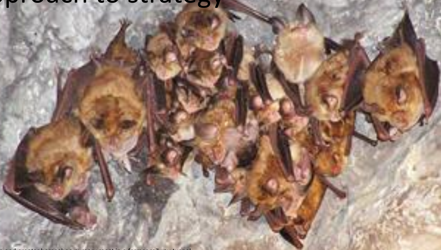
Mediterranean and greater horseshoe nursery roost in a former railway tunnel